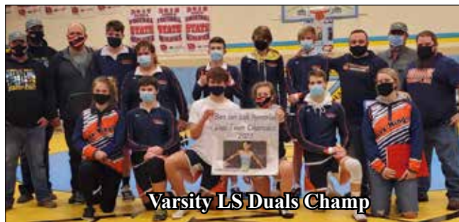
Varsity LS Duals Champ