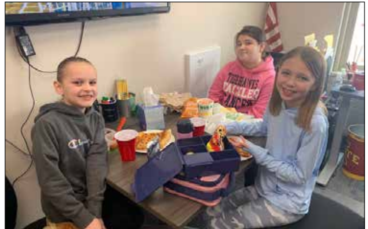
These girls purchased a pizza party and catered lunch with their Soar Bucks.