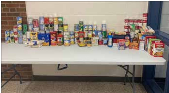
The first day of food drive collections!

The 4-6th grade concert has been moved to Tuesday, March 28th and is now combined with 7-8th grade concert. The 4-8th concert on the 28th will be at 6pm and will be at the elementary school.