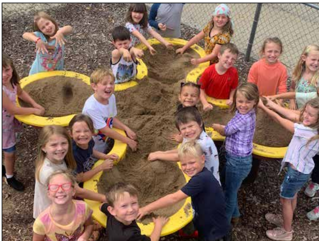
(Left, top) Students enjoying fresh sand in the playground sandbox.

During the 21-22 school year, the Colfax-Mingo PTA reorganized and became PIE (Partners in Education). PIE has expanded from a Pk-6 to Pk-12. The team continues to look for new members. Please check out the Friday Note on the district website to find a membership form.