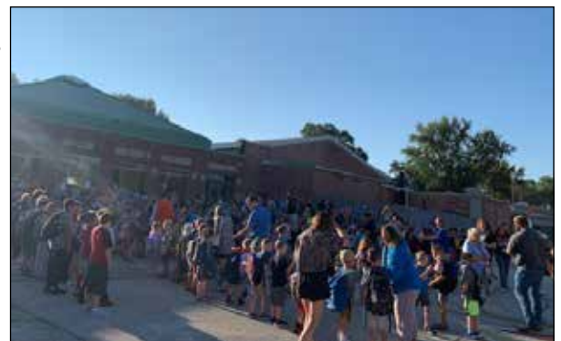
(Right, below) Continuing the tradition of the Friday Morning Welcome.