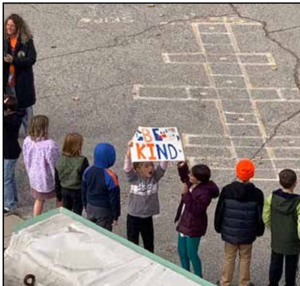
Unity Day pictures: Students joining in unity on the playground and cheering during the honk and wave