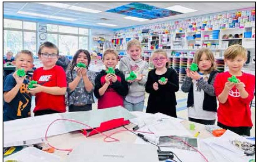
1st grade students beginning a unity with clay and practicing with modeling clay.