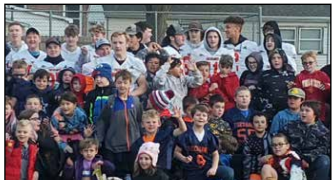
High School sports teams joined the elementary for the Friday Welcome