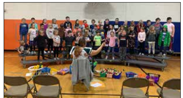
2nd grade practicing for Fine Arts Night