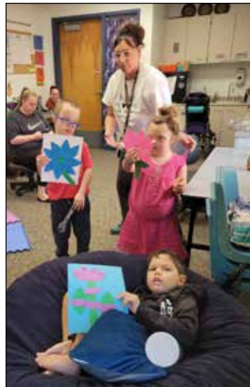
Reading with a snack!

Growth Mindset and Unique Learning are two