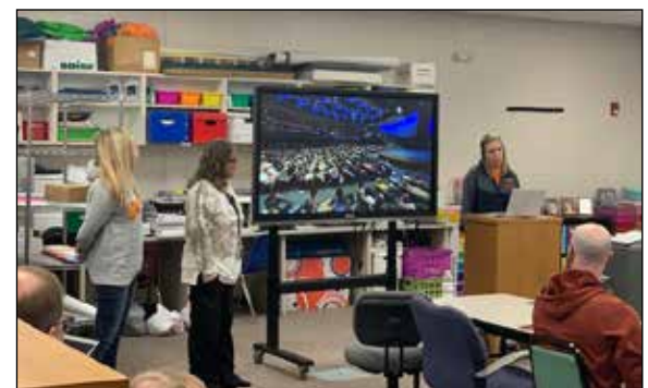
Staff presenting during professional development.