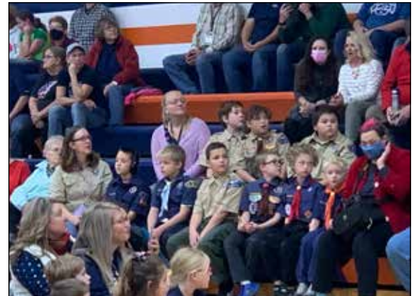
Scouts at the Veterans Day Celebration