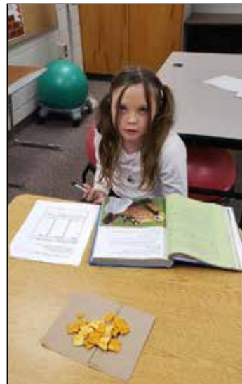
Colors and shapes.

Unique Learning is an online program that can be used in the classroom and at home. Unique Learning System is a one-of-a-kind solution designed specifically to help students with special learn-