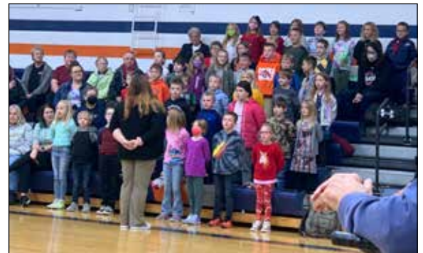
2nd grade singing at the Veterans Day Celebration